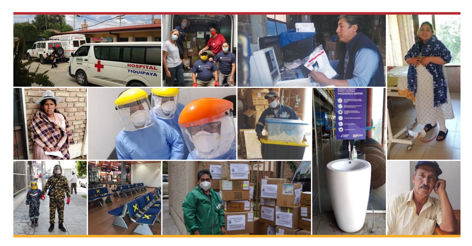
2020 ANNUAL REPORT