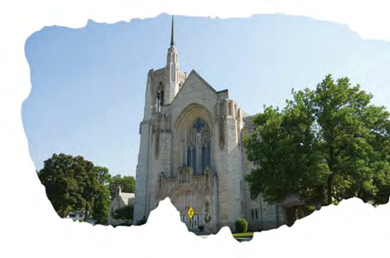
Solidarity Bridge partners with church communities in diverse ways—mission preaching, adult faith enrichment, Advent and Lenten causes, training in solidarity and service, and more.

Visit solidaritybridge.org/parishresources to learn how your parish can connect with the mission of Solidarity Bridge.